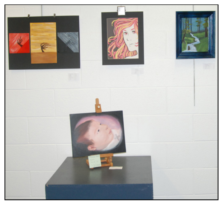
An exhibit of student artwork is currently on display in the OCC Anderson Library Gallery.

Gallery hours are 7:30 a.m. to 6:30 p.m. Monday, Tuesday and Thursday and 7:30 a.m. to 4:30 p.m. Wednesday and Friday.