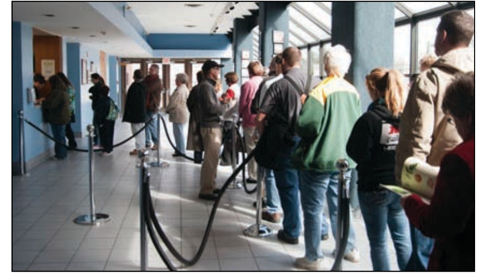
A long line was waiting when tickets for the OCC Theatre's upcoming production of "Shrek the Musical" went on sale Feb. 24. Tickets are still available and can be purchased from 10 a.m. to 2 p.m. Monday through Friday in the lobby of the Dr. John D. Stull Performing Arts Center.