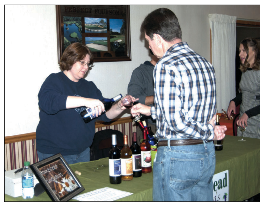
OCC Foundation Wine Tasting Affair

Performances are scheduled for 7:30 p.m. on March 21, 22, 27, 28 and 29. Afternoon shows will begin at 2 p.m. on March 23 and 30.