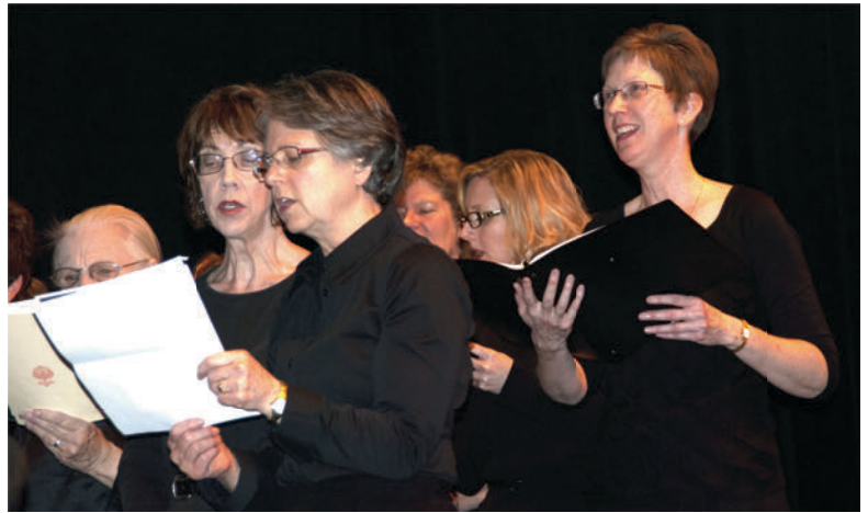
The OCC Community Chorus presents a selection during its 2013 concert.