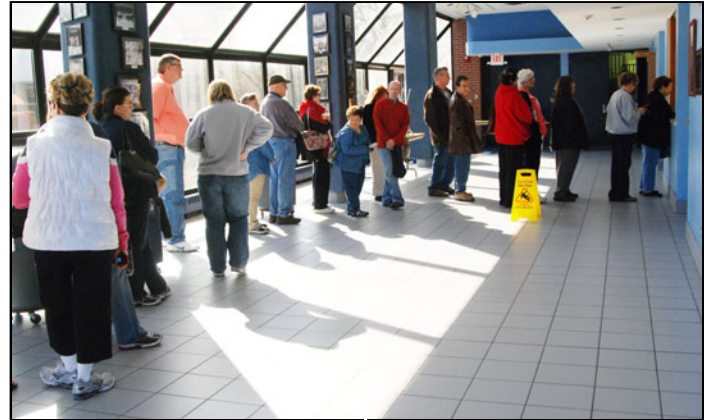
People wait in line for tickets to the OCC Theatre's upcoming production of "Seussical" to go on sale Feb. 27. A new record for opening day ticket sales was set.

those planning to attend to reserve their tickets as soon as possible.