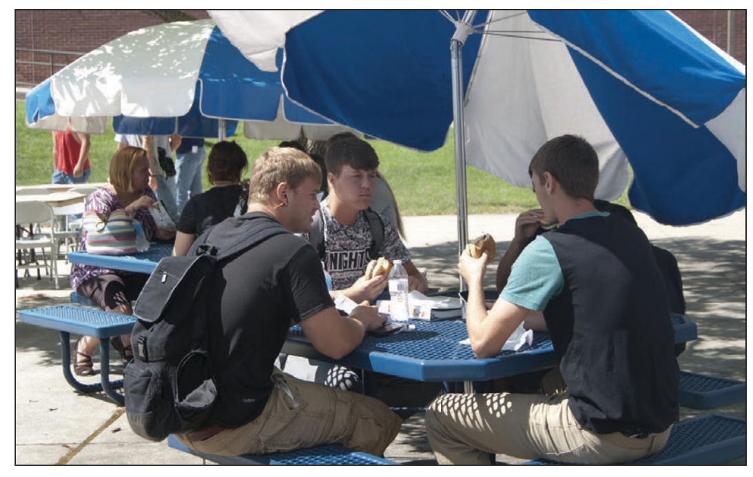
OCC WELCOME BACK COOKOUT

Purple Briefcase is the main platform OCC uses to post internships, job opportunities and other important career-related info. All students are encouraged to visit the new site and become familiar with the interface. If you have questions about Purple Briefcase or Career Services at OCC, contact Alldredge at alldredgea@iecc.edu or at 395-7777, ext. 2142.