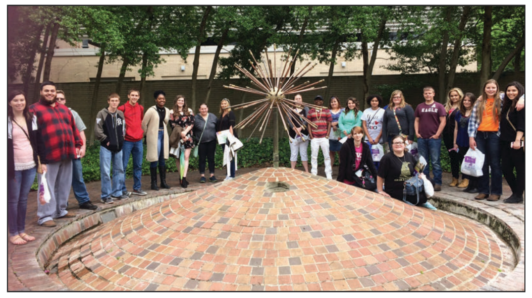
Students in the TRIO Student Support Services Program visit the University of Evansville.

All services are free of charge to all participants. Visits to four-year universities and cultural trips are some of the most popular benefits offered to the students. The opportunity for students to travel outside their own geographic regions has opened the eyes of the stu-