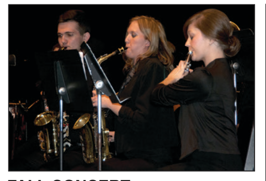
FALL CONCERT The OCC Concert Band, Concert Choir and Jazz Ensemble presented their Fall Concert Oct. 30-31.

vided in a visual and motion format with questions that will be calculated off site to access educational outreach.