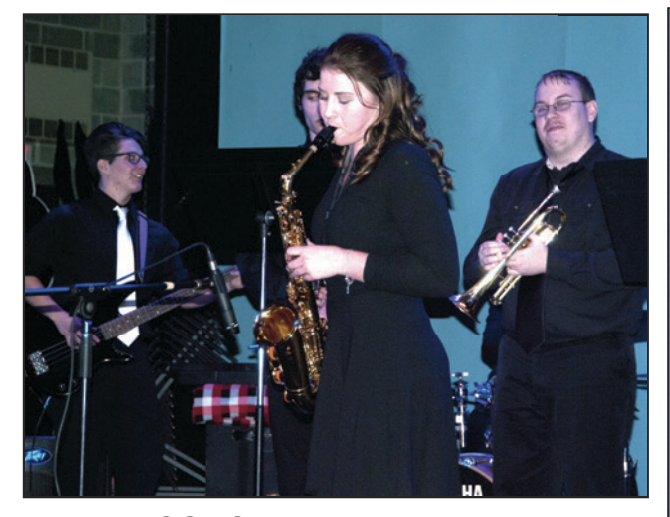
WINTER CONCERT The OCC Music Department presented its Winter Concert Feb. 17-18 featuring the Concert Band, Concert Choir and the Jazz Ensemble.

Since the TRIO SSS program encourages its students to transfer to four-year universities, the academic counselors want them to have knowledge of all aspects of being in a larger academic setting and be prepared. After lunch, the group headed to The Master's Hands in Olney where they helped clean, organized the food pantry, and organized the thrift store.