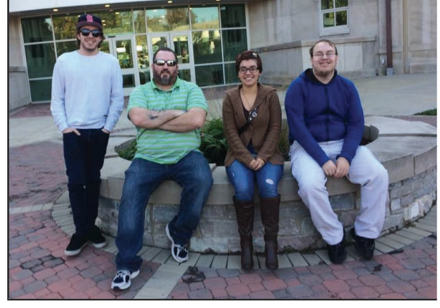
dents have applied for federal aid for next year. The week of Oct. 28 TPIO SSS in Carbondale. OCC students in the TRIO Student Support Services Program visited Southern Illinois University in Carbondale.

October was a busy month for the Illinois Eastern Community Colleges TRIO Student Support Services program. Because of the new FAFSA rules enabling students to apply for federal student aid starting Oct. 1 for the following academic year, each college in the IECC District held a campus-specific workshop designed solely for the purpose of its students applying early for FAFSA for the 2017-18 academic year. At this time, more than 50 percent of the program's students have applied for federal aid for next year.