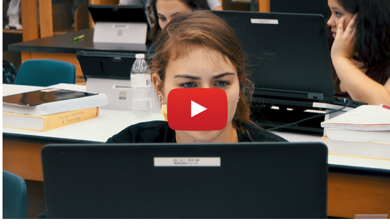
A thumbnail of LTC's Virtual Tour video available on YouTube

Another problem to tackle was how to show prospective students what Lincoln Trail College looks like. The Governor's