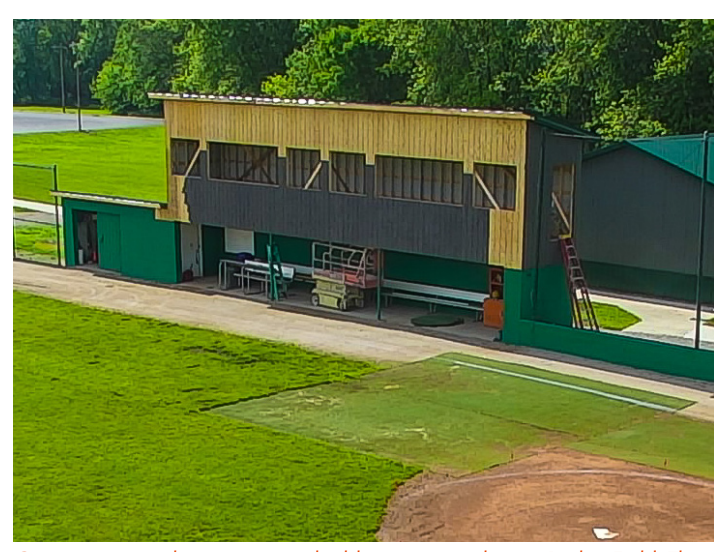
Construction work is ongoing to build a new press box at Parker Field. The project is one of several recent projects at LTC's baseball facility.