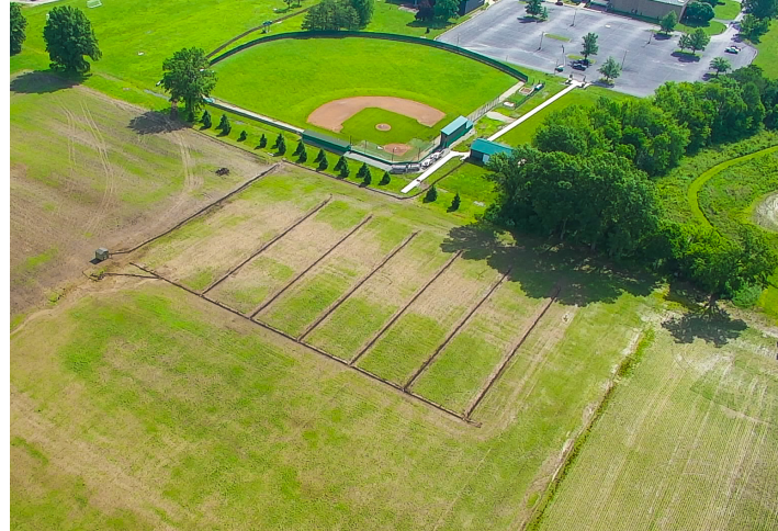
Once the irrigation work is completed field work will begin to build the competition field and the practice field to prepare them for the fall season.