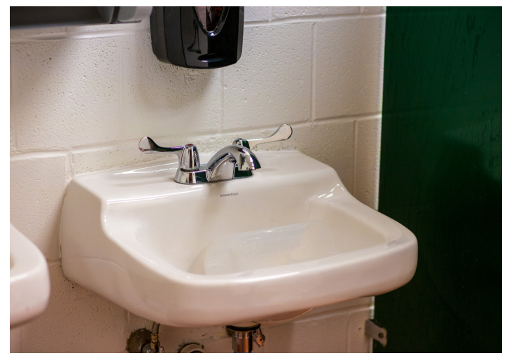
Restroom fixtures were upgraded in Williams Hall.