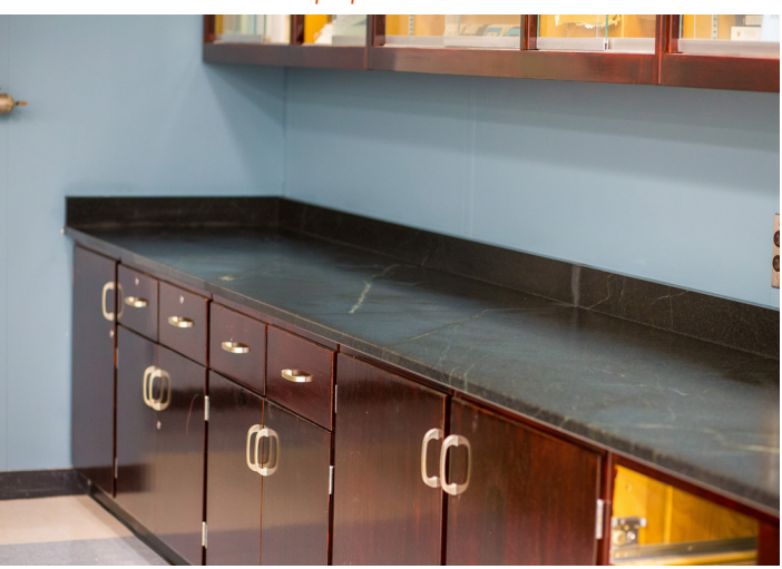
New counter tops were installed in the Anatomy Lab in Williams Hall. The new counters match student work stations installed last year.