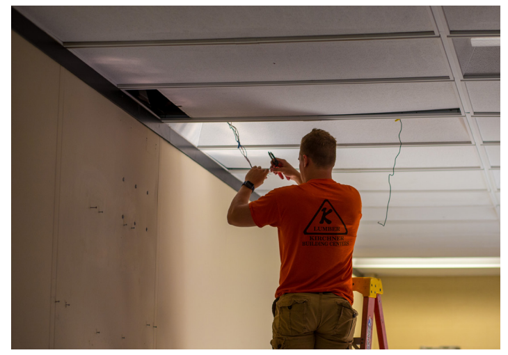
A contractor from Central State Construction works on replacing lights in Williams Hall. Labor was donated through the PPP loan program.