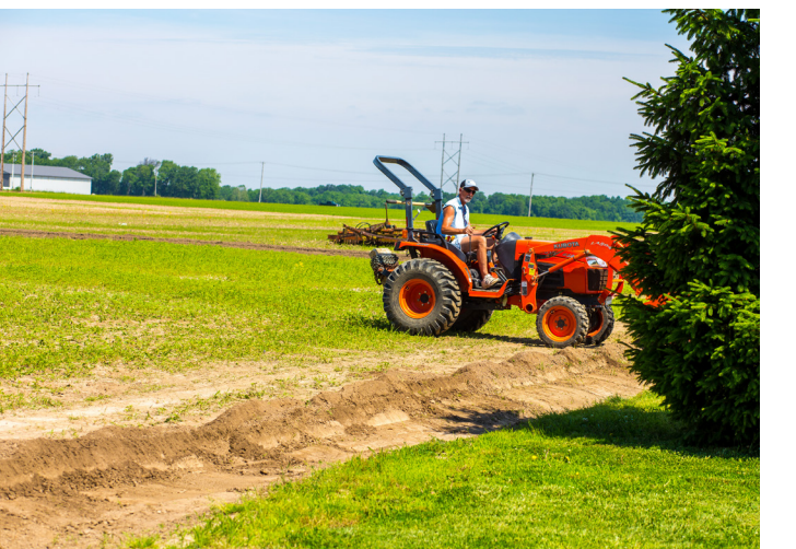
A contractor digs trenches as work gets underway to install irrigation at Statesmen Park.