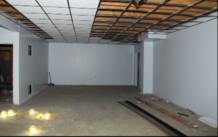
The dry wall if finished and a coat of fresh paint has been applied to the weight room. Ceiling tile are going in.