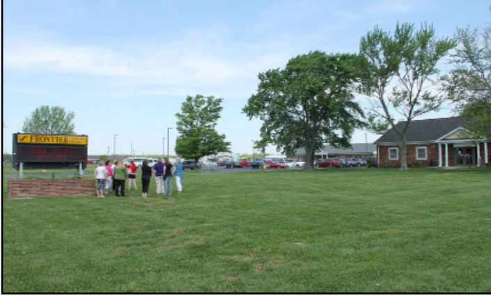
Student Services fire drill: Staff and students exited the building and congregated at the electronic sign.