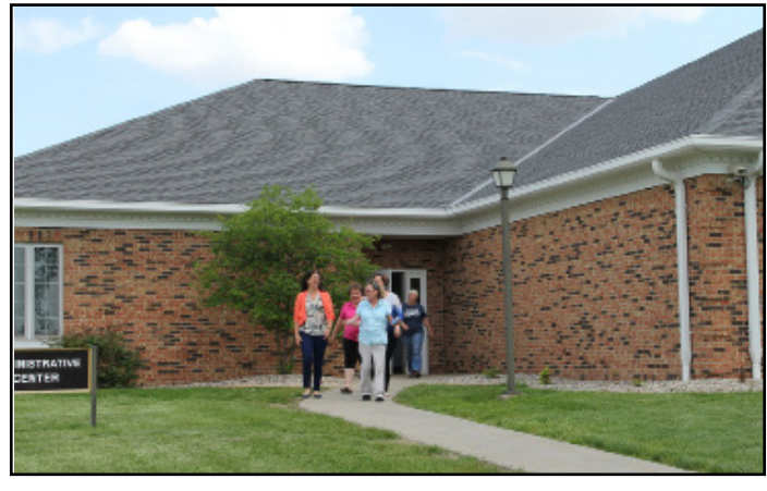
Mason Building fire drill: Staff exited the building and congregated on the front lawn.