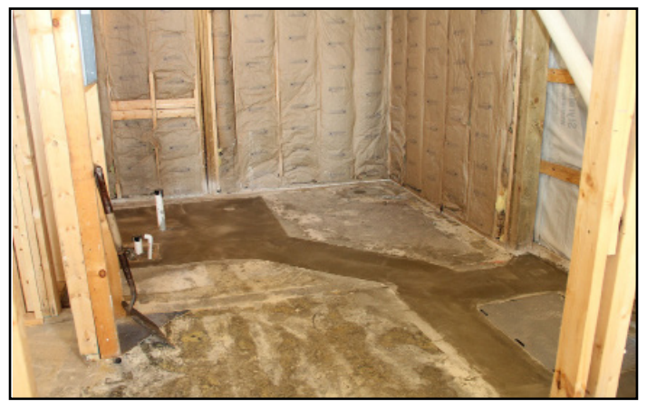
Plumbing has been roughed in and concrete poured in the Bobcat Coffeehouse / student lounge.