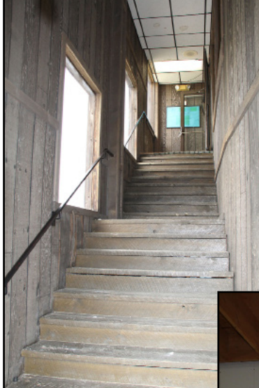
Left: West door entry. Stairway to be removed and rebuilt by Construction Technology students. Windows will be framed in and walls and ceiling will be