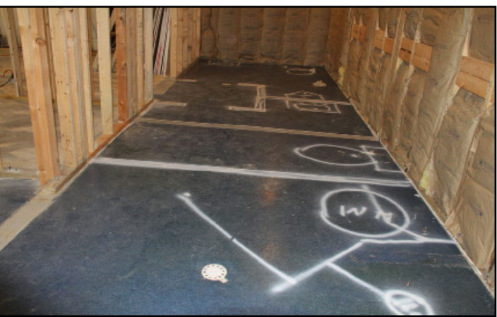
Two restrooms (men/women) and the furnace room with ice machine.