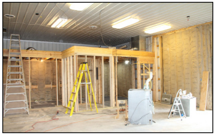
The Bobcat Den Coffeeshouse - the walls and ceiling will be drywalled. Sinks, counters, storage area, and ice machine will be installed.

Remodeling continues at the Bobcat Den fitness center. The lower level will house the coffeeshouse/student lounge and a weight room. The upper level will house the exercise room, office space, and locker rooms. The goal is to have it ready in August for the fall 2015 semester.