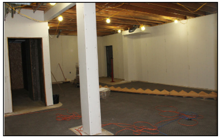
Above is the weight room. Drywall is up and waiting on crew to do the taping and mudding. Below is the exercise room that has been painted and carpet removed.