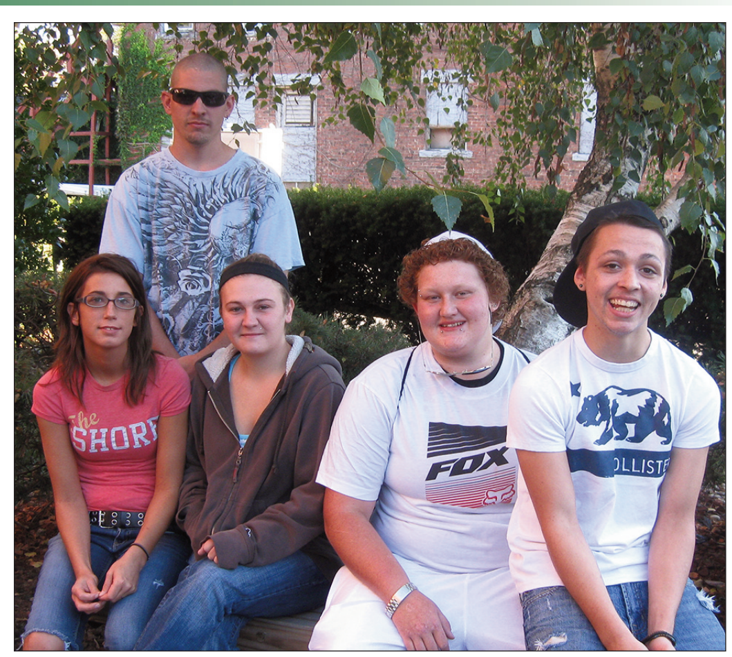
LTC GED students recently took a field trip to the Crawford County Historical Museum as part of National Adult Education and Family Literacy Week.

Network is a joint project of Lincoln Trail College & Lincoln Trail College Foundation