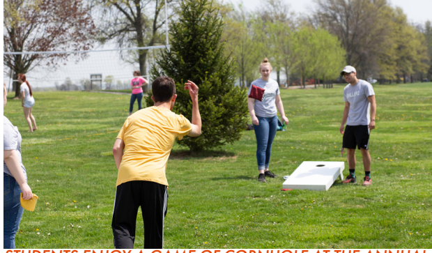
STUDENTS ENJOY A GAME OF CORNHOLE AT THE ANNUAL CRAZE DAZE EVENT AT LTC.