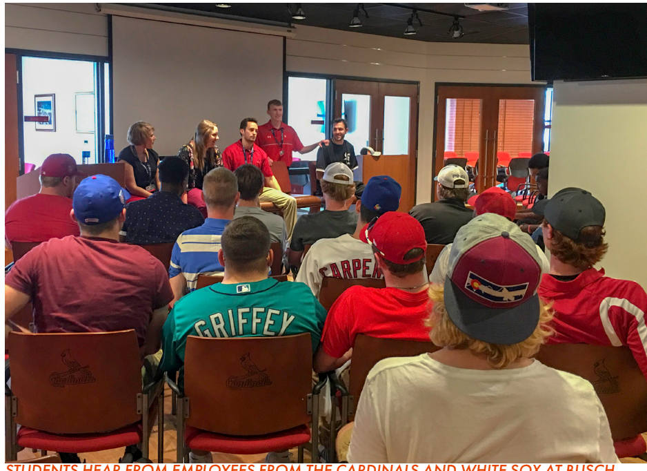
STUDENTS HEAR FROM EMPLOYEES FROM THE CARDINALS AND WHITE SOX AT BUSCH STADIUM ABOUT CAREERS IN MAJOR LEAGUE BASEBALL

Students in Lincoln Trail College's Sport Management program got the opportunity to learn about careers in Major League Baseball at an event with the St. Louis Cardinals.