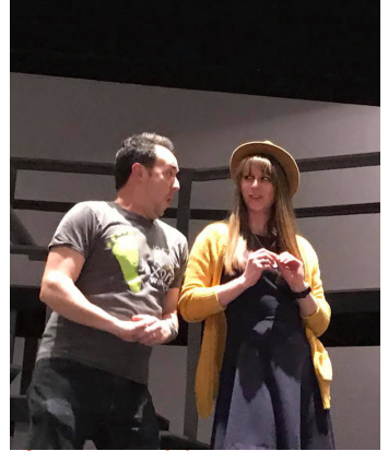
Cast members of LTC's production of Beauty and the Beast rehearse in preparation of the show. Performances are March 22-24 and March 29-31.