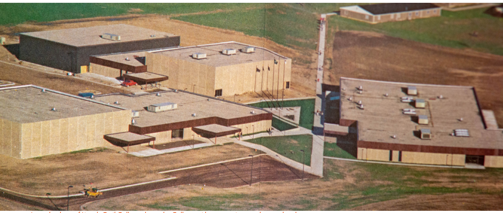
An early photo of Lincoln Trail College shows the College with construction nearly completed.