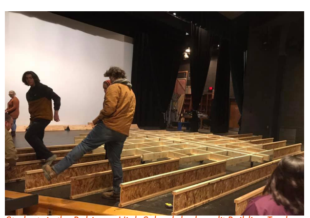
Students in the Robinson High School dual credit Building Trades class construct the set for Beauty and the Beast

Carmack says finding another space can make it particularly difficult for instrumental and vocal students to prepare for their juries, which serve as final exams for those students. "We have good practice rooms, but there's a huge difference between performing in a small practice room and performing on stage. Performing on stage changes how you sound and right now, those students get very little opportunity to prepare on stage before their juries."