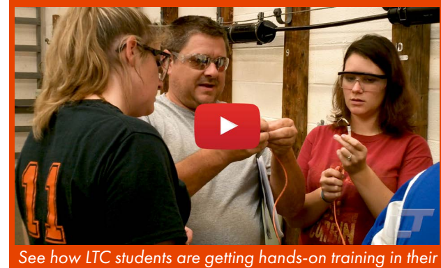
CTE programs. Watch the LTTV video: http://www.youtube.com/LincolnTrailCollege

into the workforce upon graduation. These are high-paying positions. They're careers that people may not know about or may not have considered in the past. So, if you're a student that's undecided, but you want an exciting, wellpaying career, Lincoln Trail College can help you obtain that goal.