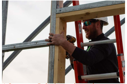
A Construction Technology student works on a building project in class