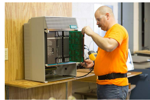
A Broadband Telecom student works on a lab project in class