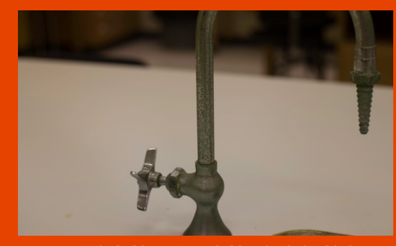
PITTING ON FIXTURES ON LAB STATIONS