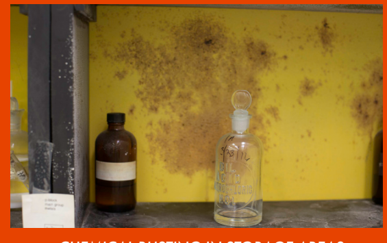
CHEMICAL RUSTING IN STORAGE AREAS