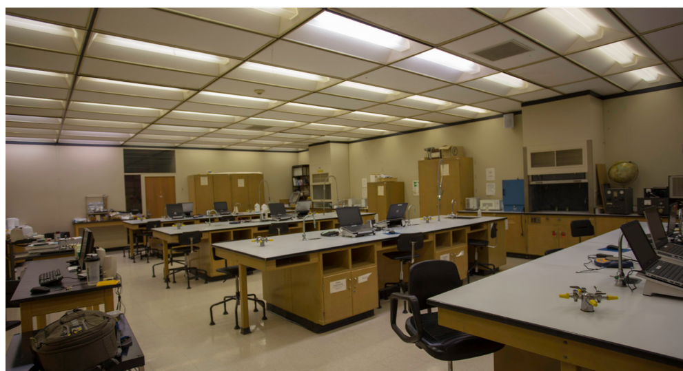
LTC'S CHEMISTRY LAB BEFORE RENOVATIONS.

LTC'S RENOVATED CHEMISTRY LAB. WORK INCLUDED NEW FLOORING, REFINISHED WORK STATIONS, AND NEW GAS AND WATER FIXTURES.