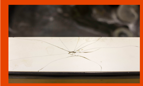
DAMAGE AND STAINING ON COUNTERTOPS