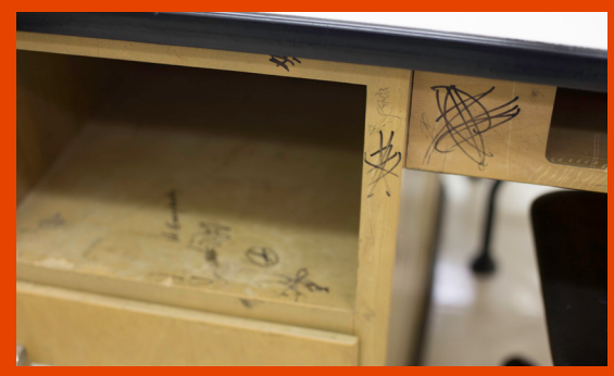
GRAFFITI WAS FOUND ON LAB STATIONS