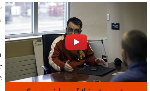
See a video of this story at: youtube.com/LincolnTrailCollege