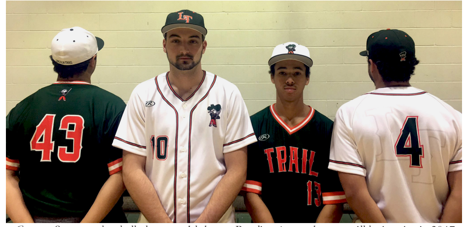
Current Statesmen baseball players model the new Rawlings jerseys the team will begin using in 2017