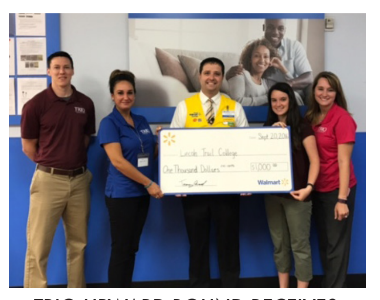
TRIO UPWARD BOUND RECEIVES GRANT

LTC is also competing against Wabash Valley College to see which college can collect the most donations. The losing college will make a donation to a food pantry of the winning college's choice.