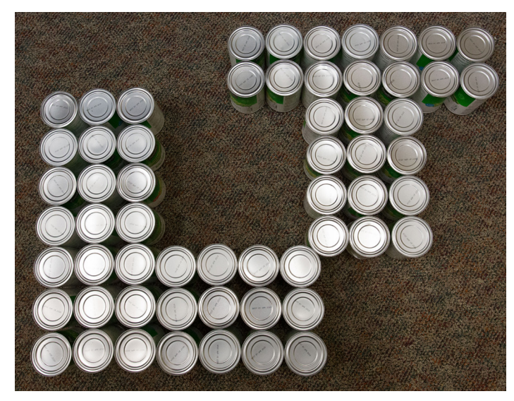
STUDENT SENATE SPONSORS FOOD DRIVE

Tickets for all Music Department events can be purchased in advance by calling the Performing Arts Office at (618) 544-8657, ext. 1433. Tickets are also available at the door the evening of the concert.