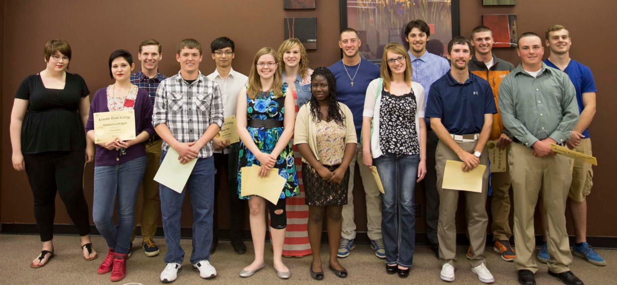
Some of the Lincoln Trail College students that earned Honors and High Honors