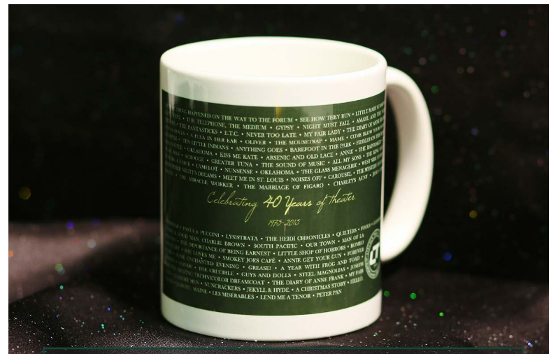
The Performing Arts Office is selling mugs to help raise funds for this year's 40th anniversary celebration. The mugs and are available at the Performing Arts Office. $20