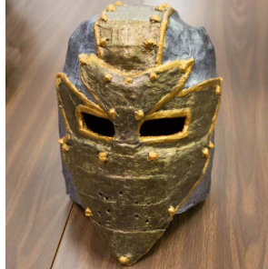
"Medieval Conqueror" Cole Worthey, OHS