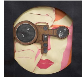
"Captured" Elaina Llewellyn, RHS Best of Show