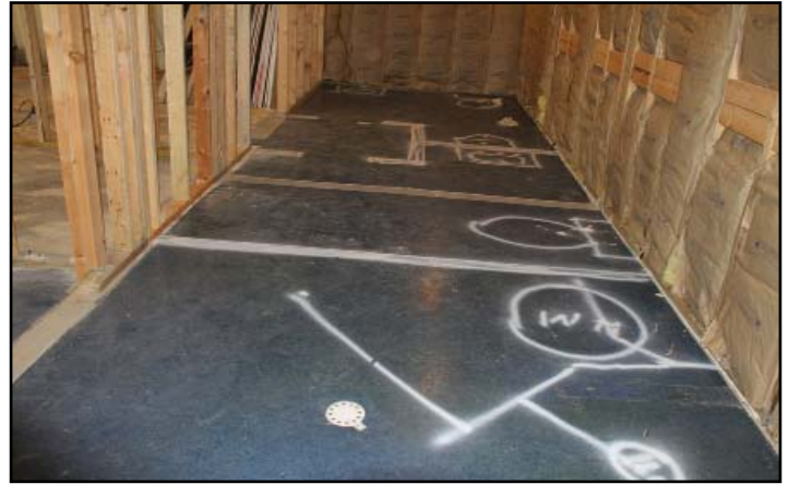
Two restrooms (men/women) and the furnace room with ice machine.