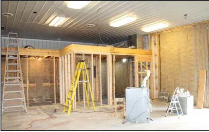
The Bobcat Den Coffeeshouse - the walls and ceiling will be drywalled. Sinks, counters, storage area, and ice machine will be installed.

Remodeling continues at the Bobcat Den fitness center. The lower level will house the coffeeshouse/student lounge and a weight room. The upper level will house the exercise room, office space, and locker rooms. The goal is to have it ready in August for the fall 2015 semester.