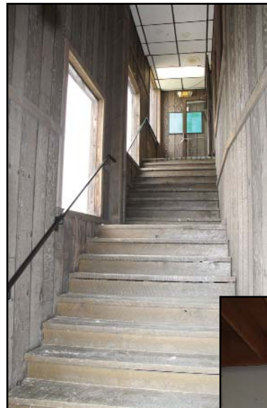
Left: West door entry. Stairway to be removed and rebuilt by Construction Technology students. Windows will be framed in and walls and ceiling will be