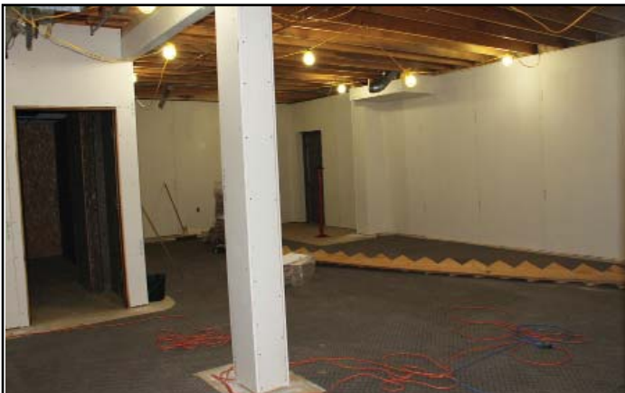
Above is the weight room. Drywall is up and waiting on crew to do the taping and mudding. Below is the exercise room that has been painted and carpet removed.