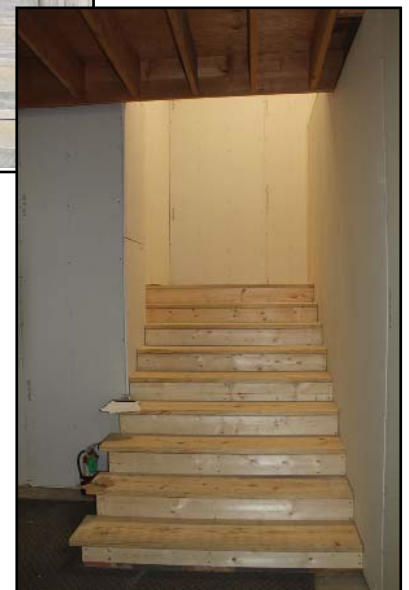
Right: Indoor staircase was rebuilt by students enrolled in the Construction Technology program.