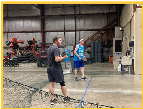
A high-intensity pickleball game in the WDC