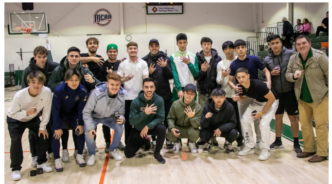
The men's soccer team received their Region 24 Championship rings during LTC's basketball games against Vincennes University.