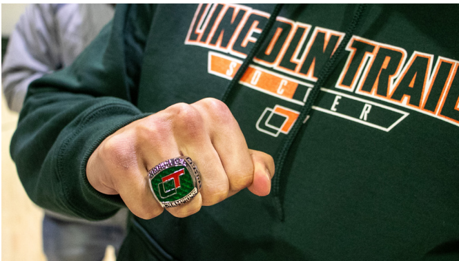
A men's soccer player shows off his Region 24 Championship Ring.