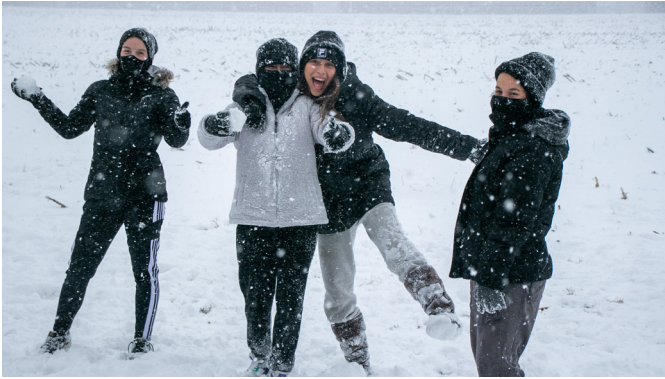
Lincoln Trail College students enjoy a fun afternoon playing around in the snow.