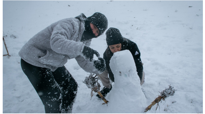
Enough snow fell that the students were able to build a snowman.