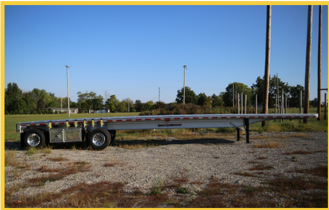
Flatbed trailer purchased from Vaughan's Equipment