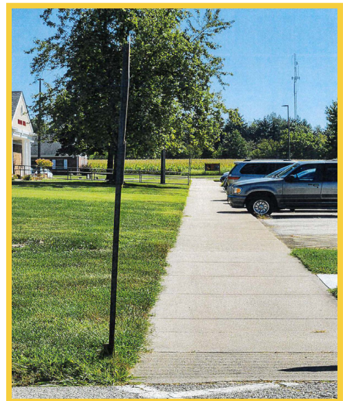
Sidewalk in front of Mason Hall where new lighting will be installed

Frontier Community College has been awarded $41,500 through the Illinois Green Economy Network (IGEN) Grant. IGEN is a consortium open to all 39 Illinois community college districts, designed to provide a platform for the colleges and their partners to drive growth of the clean energy and green workforce. FCC’s proposal for the grant included a plan to purchase and install solar-powered bollard lighting for the sidewalks on the east side of campus, which are unlit. In addition, FCC will upgrade wired/LED lighting on campus to solar-powered bollard lighting. The upgrade will reduce the college’s carbon footprint by 37.5 lbs of carbon dioxide, per bollard each year.