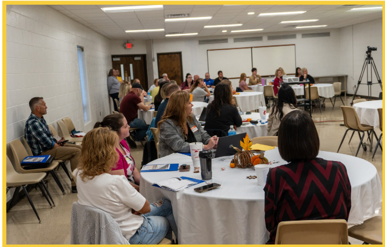
Attendees at the Employer Workshop hosted by B&I and the SBDC

Business & Industry along with the SBDC hosted an employer workshop. Attendees learned about new laws affecting employers and about resources available for recruitment and retention. Additionally, there were networking opportunities available during the event.