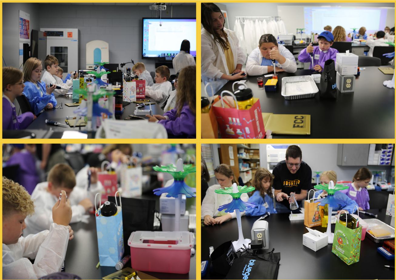
Students getting hands-on during Camp CSI