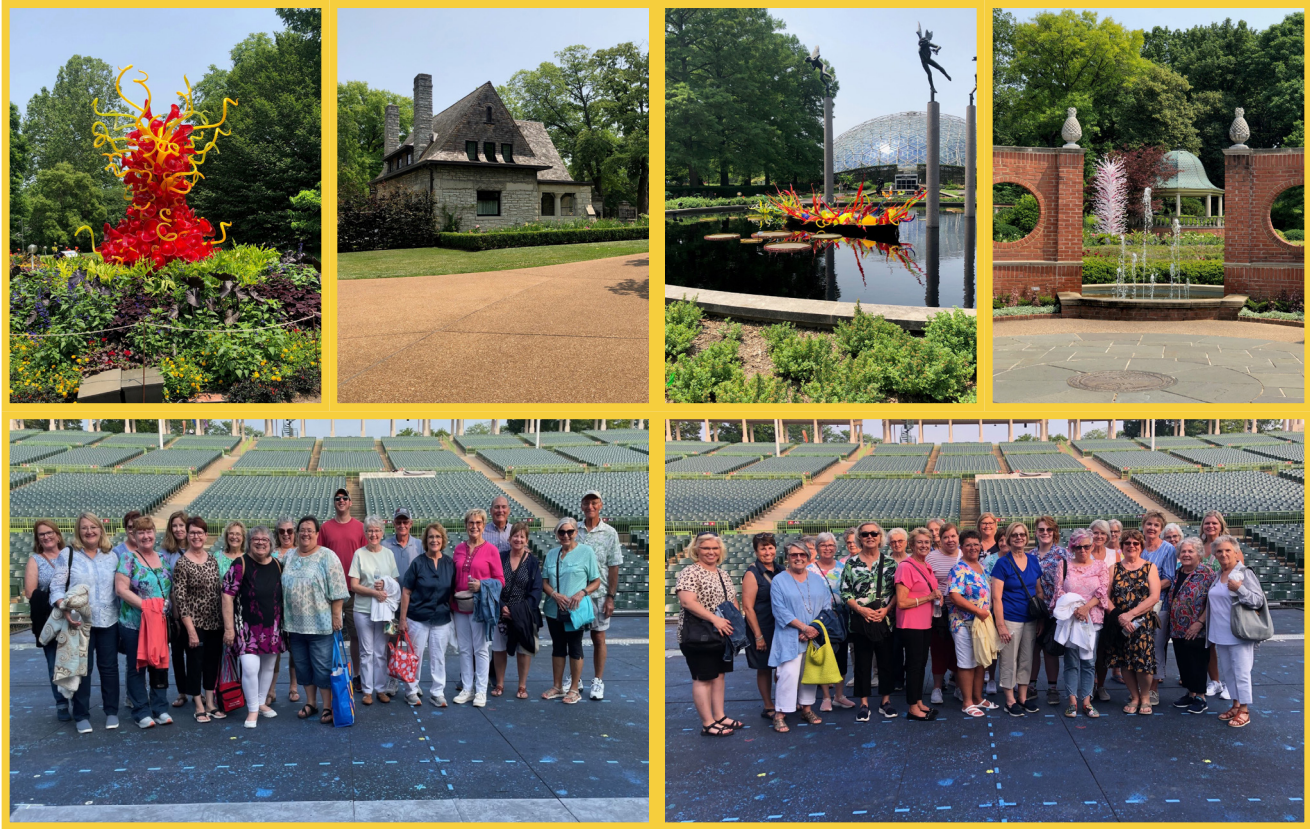
Photos of the Missouri Botanical Garden and Cultural Trip Participants

On Friday, June 16th, a group of people from the local community, accompanied by a few FCC staff members, went to St. Louis for a day of fun. The agenda for the day included a variety of stops including a visit to the Missouri Botanical Garden, dinner in the city, a tour of the Muny Theatre, and seeing the performance of “Beautiful: The Carole King Musical.”