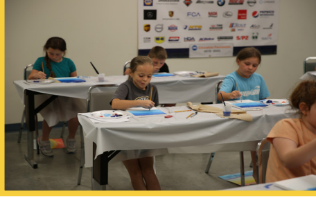
Students enjoying some hands-on fun at kids camps