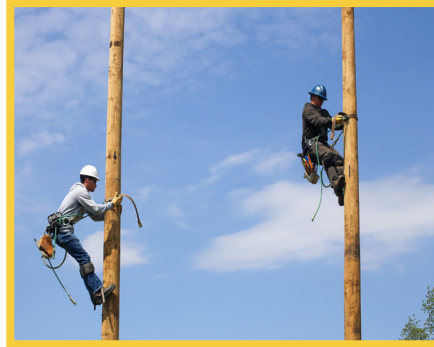
FCC EDS students giving a pole climbing demonstration