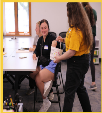
FCC students donating to the LTC recovery