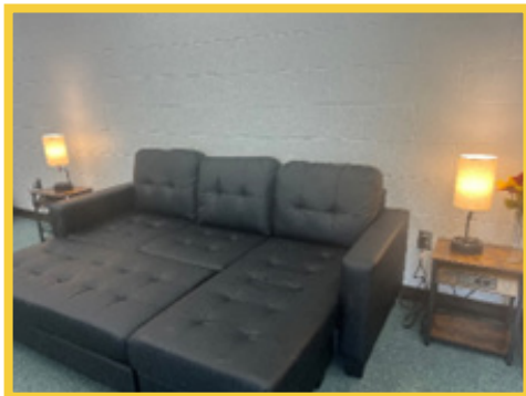
New, relaxing furniture in the student lounge