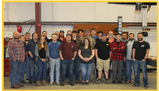
Current and former FCC auto students