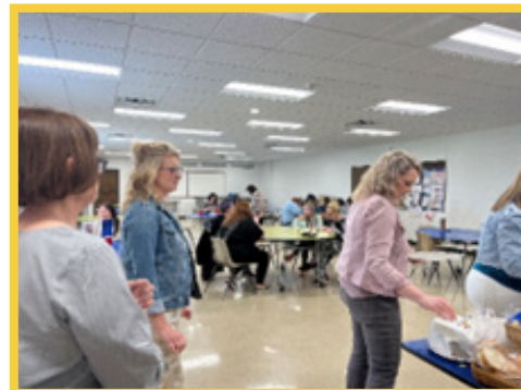
Staff and students enjoying the end-of-year cookout