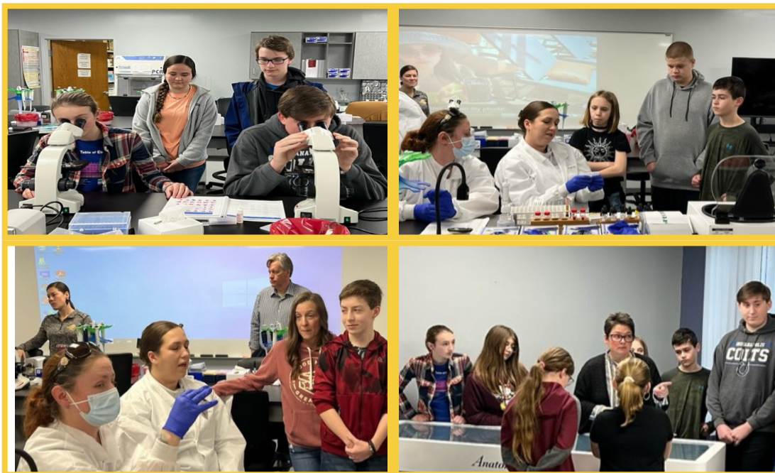
Home-schooled students visiting FCC's science classrooms, checking out blood under the microscope and learning about the Anatomage virtual dissection table