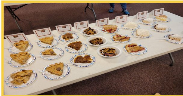
A Variety of Homemade Pies