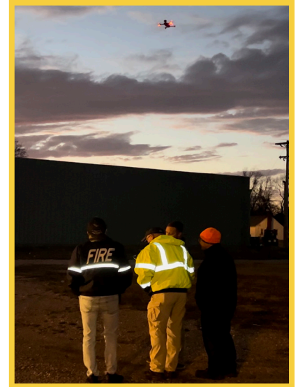
Class participants flying the drone