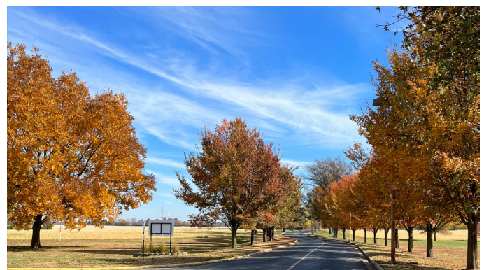
Lincoln Trail College's vibrant Fall foliage highlights the main entrance to campus.