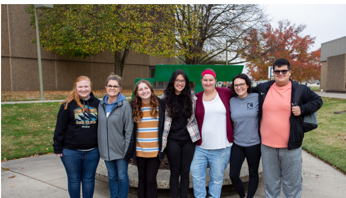
Lincoln Trail College celebrated the success of first-generation college students, faculty, staff, and alumni on National First-Generation College Celebration Day.