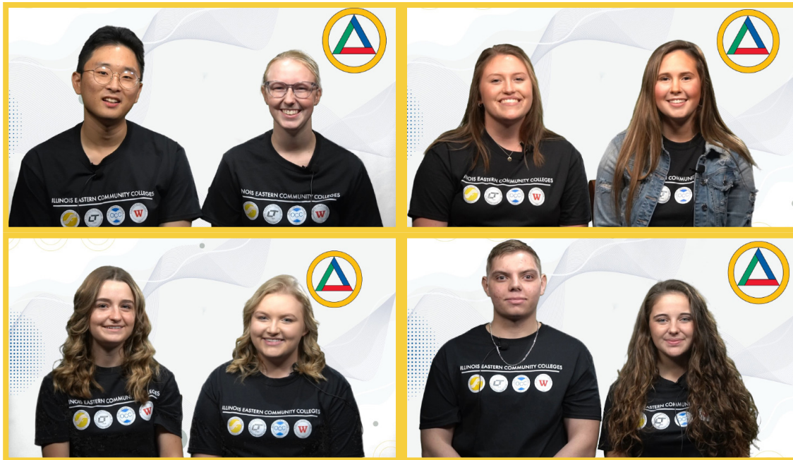
Students from all four IECC campuses who participated in the online orientation