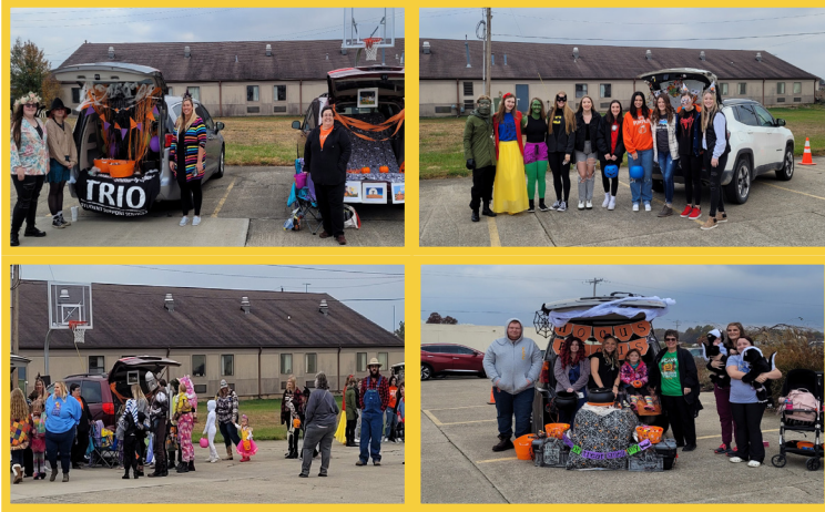
Some FCC students, staff, and visitors during trunk or treat