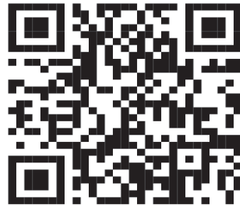
QR Code for B&I Webpage