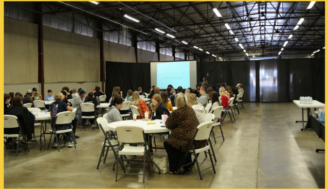
Local high school students learning about various FCC programs