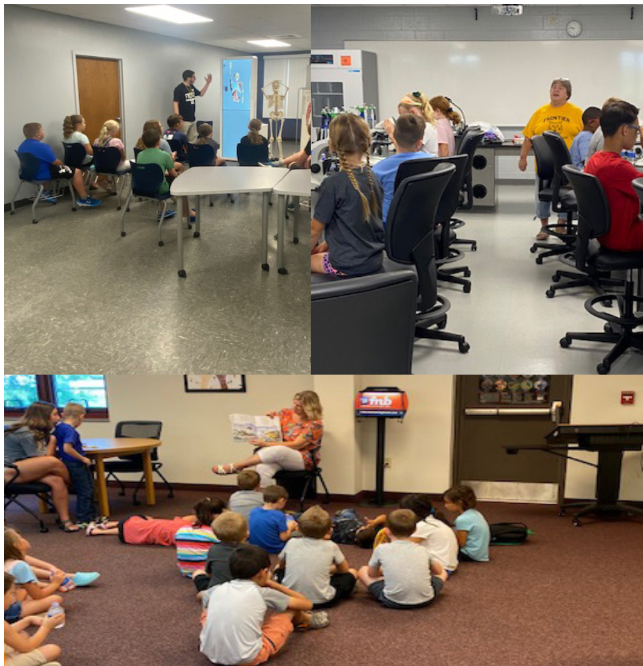
Kids in Motion participants seeing the new Anatomage table, learning about microscopes in Mason Hall and intently listening to a book being read in the FCC Library