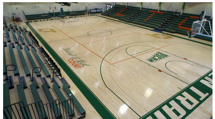
Richard Roth Court in the Lincoln Trail College Sports Center was refinished over the summer.