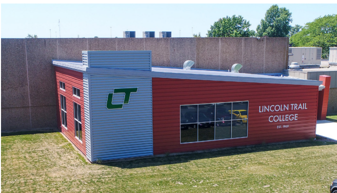
A drone shot captures the exterior of Lackey Music Hall

Welcome Back Blast runs from 11:30 to 1:30 on Aug. 17.