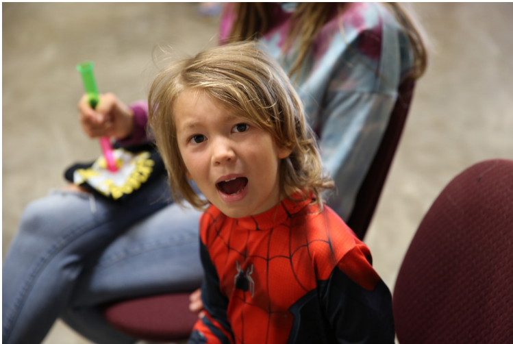
The bewilderment on the face of one attendee of the magic show. He could be heard asking anyone around him, “How he do that?”

No Cubs fans showed up to face this mob of Cardinals Diehards dressed up for the “Sports Dress-Up Day” for FCC’s summer fun dress-up days!