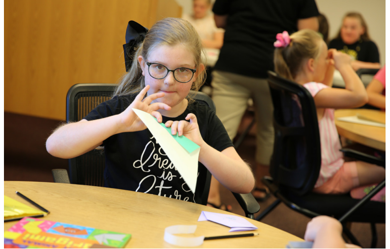
Kids were letting their creativity fly at Art Attack and Origami Classes!