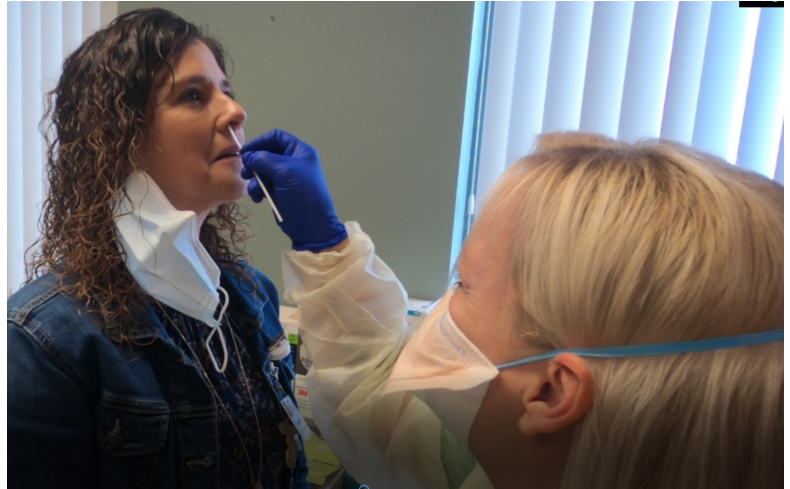
CMA Student working at an internship

Sometimes this flexibility can be a deciding factor when potential students choose where to go to school. With this and FCC's efforts to offer classes in various formats, finding time to take courses is easier than ever. Accommodating student needs gives even more people the chance to receive a college education and expands FCC's reach to previously untapped markets.