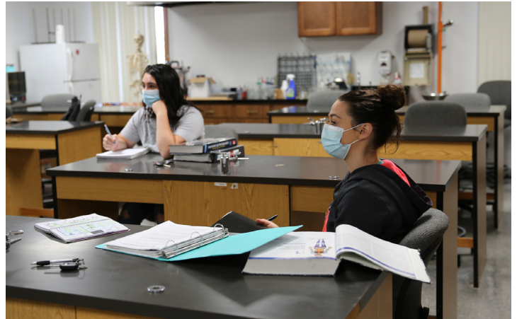
Students in Mason Hall Biology lab, before renovation

Currently, one other course at FCC is under review for QM certification. After completing this review, the Title III team intends to apply the QM methods to other FCC courses that are migrating to a hybrid model. The future of education is increasingly digital. While FCC still has a robust offering of in-person classes, this addition of premier-quality hybrid courses will allow more students in the region to access the college’s top-notch education.