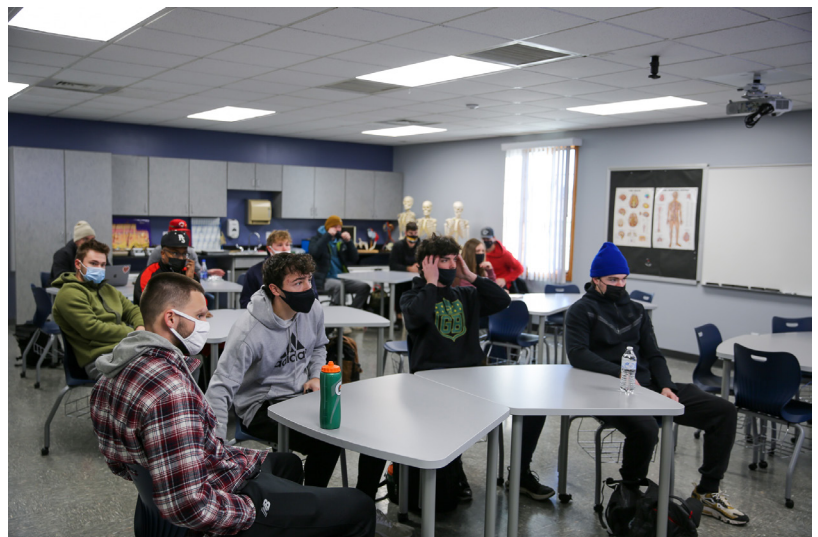
Students in the recently finished Mason Hall room 23