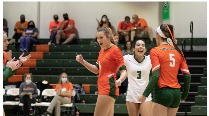
LTC volleyball players celebrate after scoring a point against Southwestern on Orange Out Night.