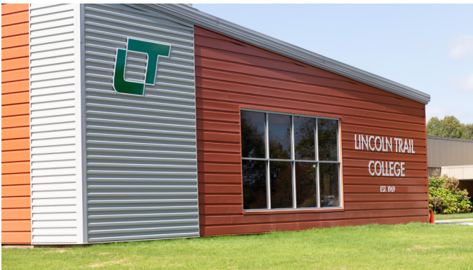
Signage is up for Lackey Music Hall.

enough for being my backbone throughout this amazing experience.”