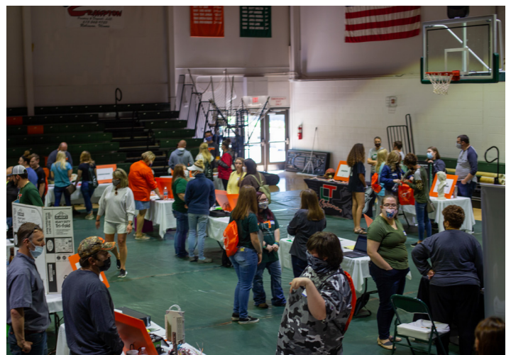
LTC faculty and staff interact with future Statesmen at the College’s annual Admitted Student Day.