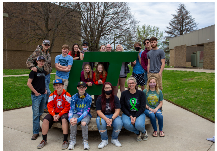
Hutsonville High School’s Class of ‘21 visited LTC. They learned about college programs and toured the campus on their visit.