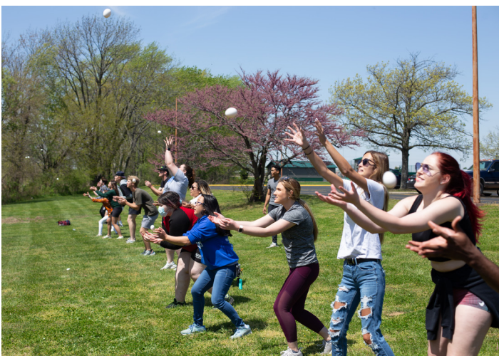
LTC students enjoy a game of egg toss at LTC’s Craze Daze. The day featured free food and many different games for students.