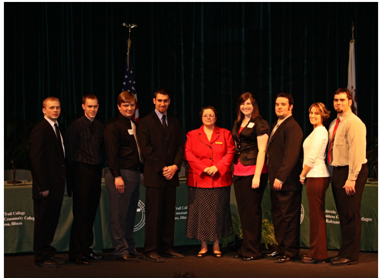
The LTC Political Society staged a Candidate's Debate in 2010

Another one of her favorite memories at LTC is when the College Republicans and College Democrats merged into the LTC Political Society. "Seeing students learn to make logical arguments and to actually listen and understand the opposing side was great. They learned to research, critically analyze, critically listen, and to respect opposing opinions to their own."