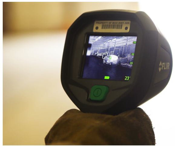
Students can easily detect and gauge the temperature of a lawnmower, shown in the screen of the thermal imaging camera.

Current curriculum for Fire Science is mandated by the State Fire Marshal's Office and teaches the latest tried and true search, rescue, and safety techniques. The integration of the thermal imaging cameras will allow students to learn about the importance of technology in firefighting. They will also be a valuable tool during active training exercise to create real-life situations and scenarios.