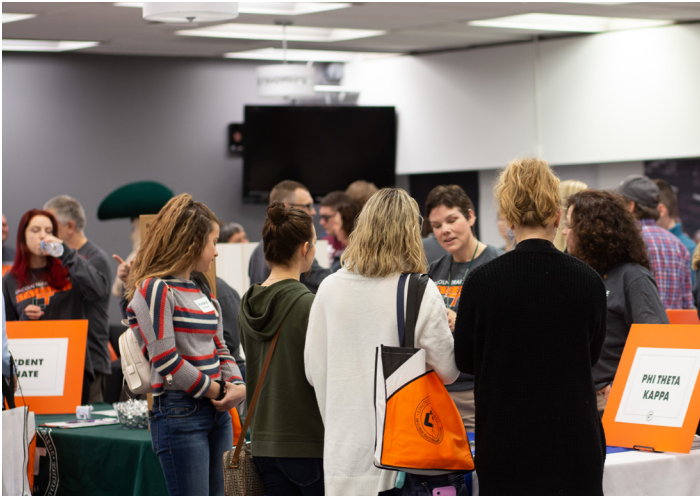
Students browse the different booths to learn about programs and activities available at Lincoln Trail College.