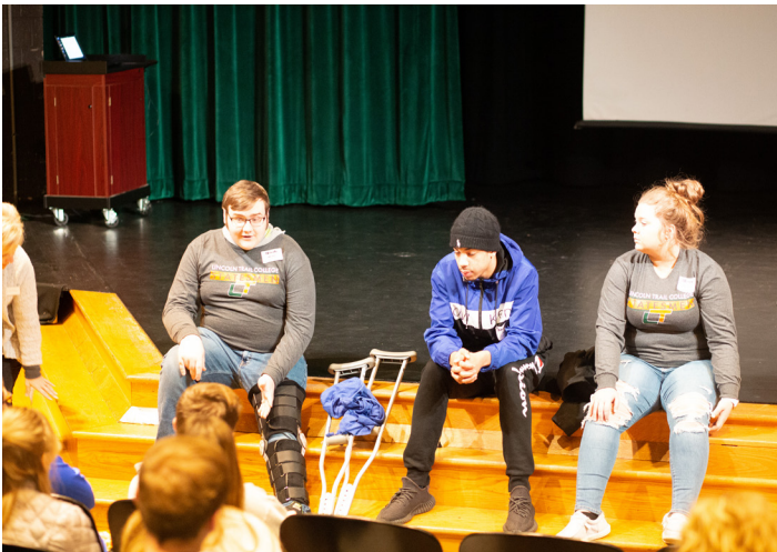
A panel of current students talks to prospective students about their experiences at Lincoln Trail College.