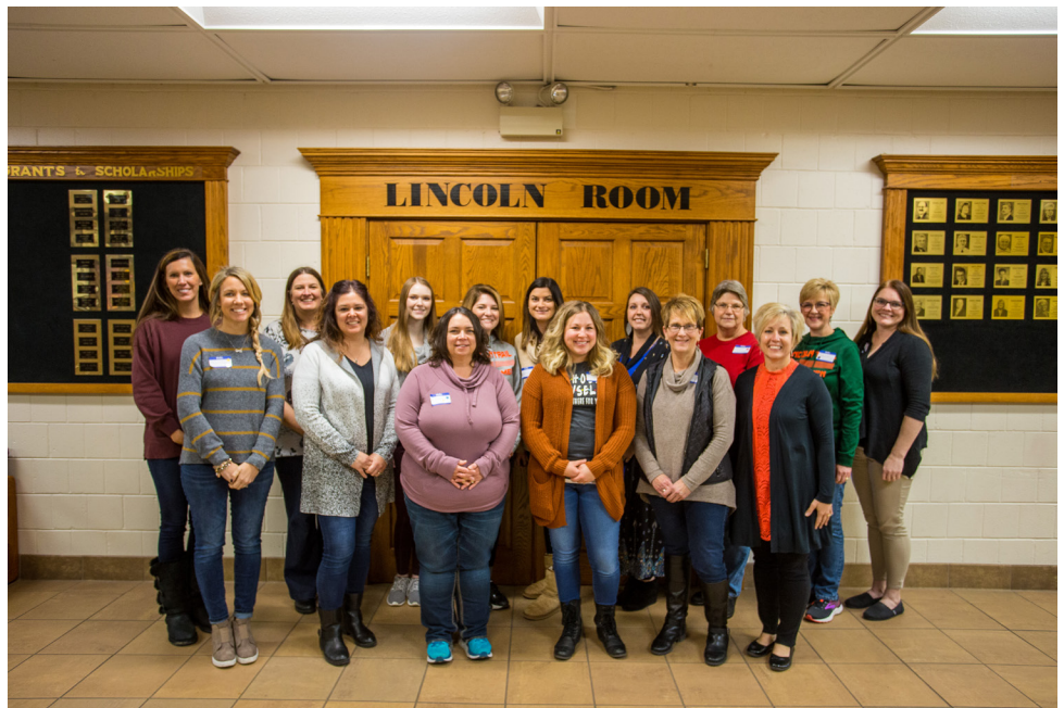
Thirteen Middle/High School Counselors and Social Workers from four different counties (Crawford, Clay, Clark and Lawrence) participated in a six-hour Professional Development Workshop at Lincoln Trail College that included in depth collaboration and sharing best practices with fellow counselors, guest speakers discussing Mental Health topics, as well as strategies for Creating a College Going Culture and Career Readiness.