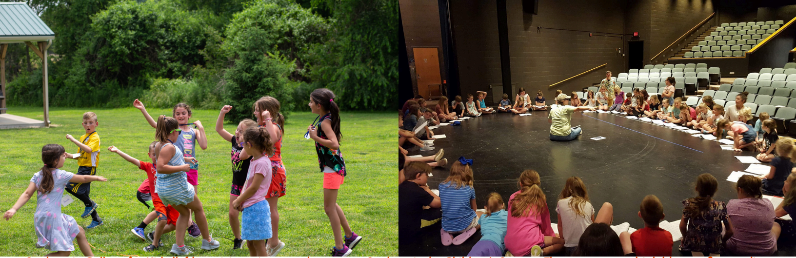
Students in College for Kids (left) participate in an outdoor game. Students in the Children's Summer Theater program (right) have a first reading.

Local kids are spending part of their summer at Lincoln Trail College, participating in a variety of activities. Once again, the College is offering the popular Children's Summer Theater program along with three sections of College for Kids.