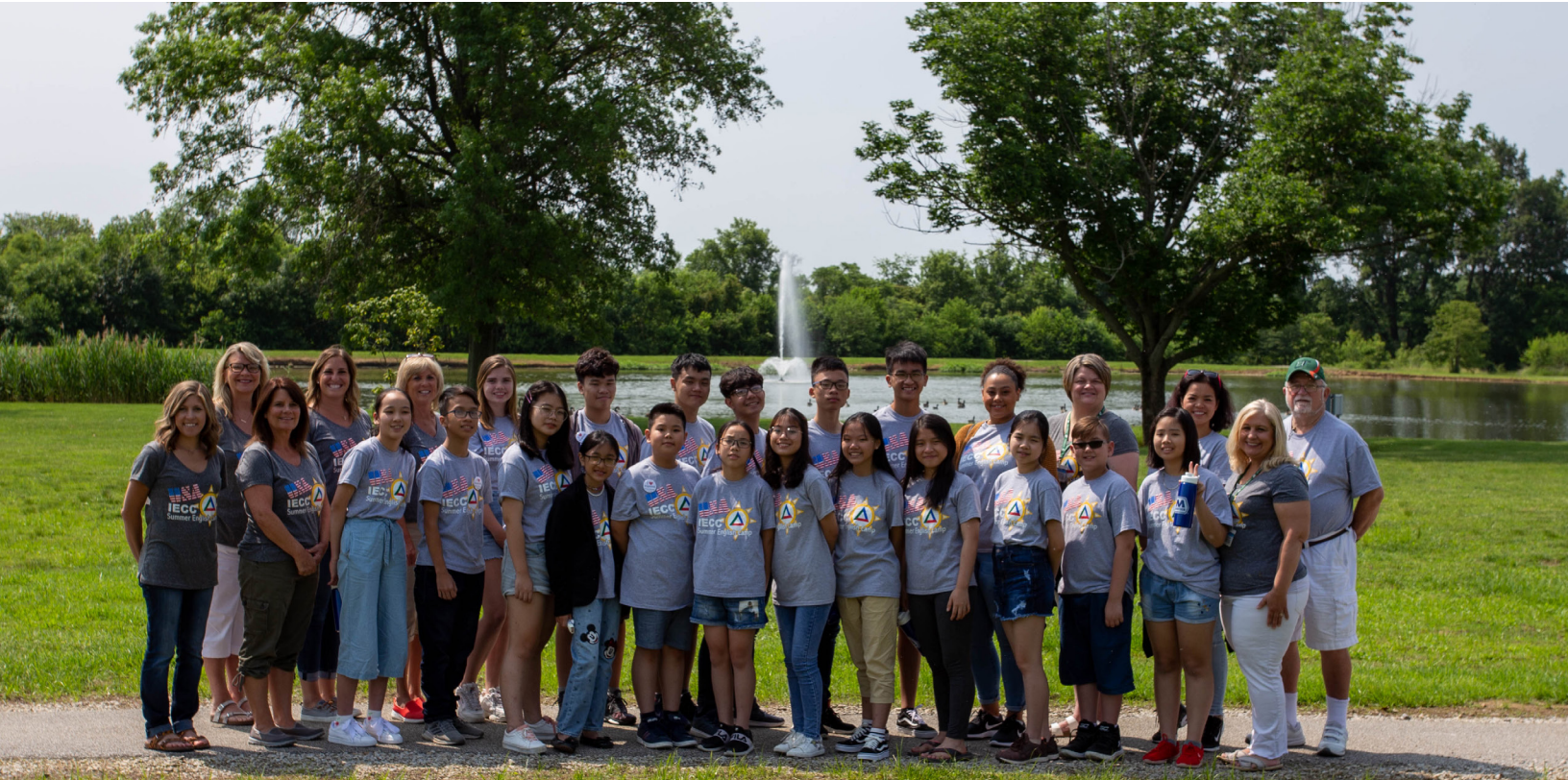
Students and instructors from the IECC Summer English program