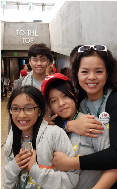
Summer English Camp visit the Gateway Arch in St. Louis.