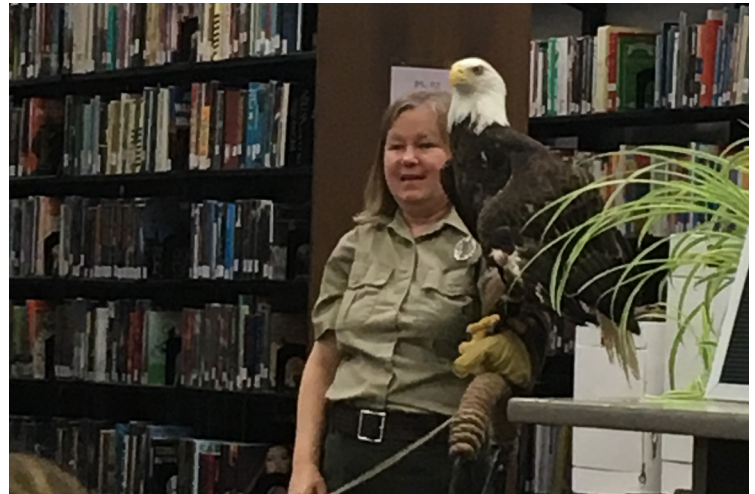
The Indiana Department of Conservation provided a program on raptors for College for Kids. They brought a screech owl, a barred owl, a peregrine falcon, a red-tailed hawk, and a bald eagle.

Lincoln Trail College publishes an annual catalog featuring classes that specifically appeal to members of the community, making it easy for them to find what’s available.