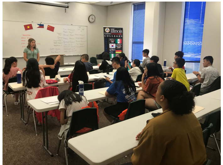
Students spend time learning English during an ESL class