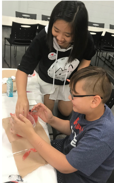
Summer English Camp make slime with the LTC College for Kids program.