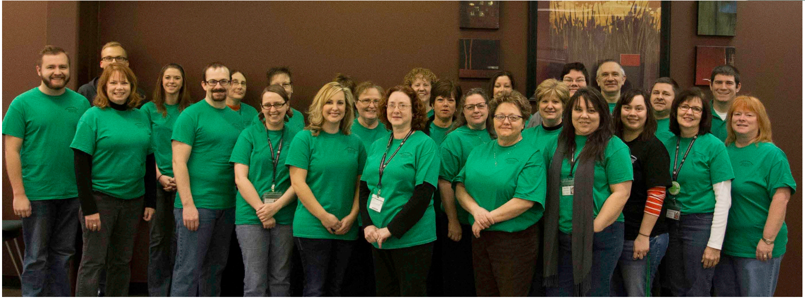
Lincoln Trail College faculty & staff have been wearing T-shirts on Fridays to help remind them about their roles in the upcoming HLC Visit.