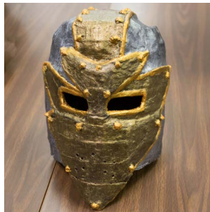
"Medieval Conqueror" Cole Worthey, OHS