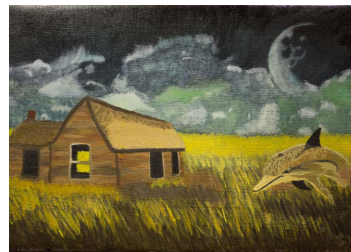
"Path Less Traveled" Laura Purcell, OHS