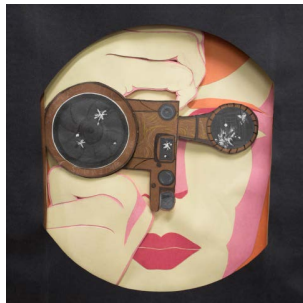
"Captured" Elaina Llewellyn, RHS Best of Show