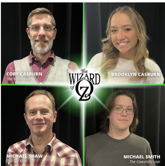
The main characters of the play

With dazzling sets, captivating performances, and beloved tunes, "The Wizard of Oz" will whisk audiences away on a magical journey! Tickets for the Thursday, February 22nd and Friday, February 23rd show can be purchased at https://iecc.edu/wvc/theatre .