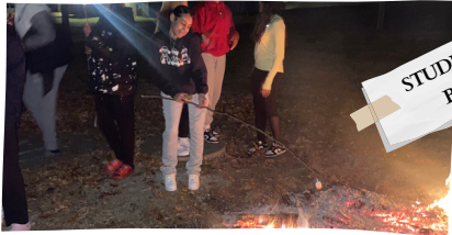
STUDENT LIFE: BONFIRE