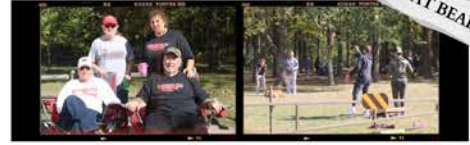
ATHLETICS DAY AT BEALL PARK