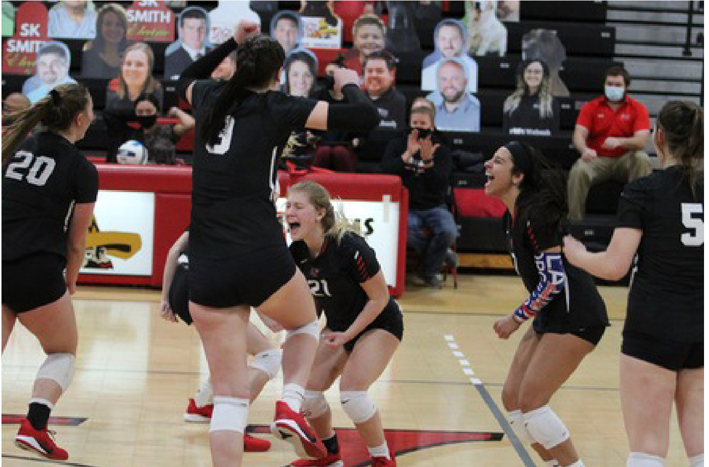
The Lady Warriors celebrate the winning point in a five-set upset of John A. Logan.